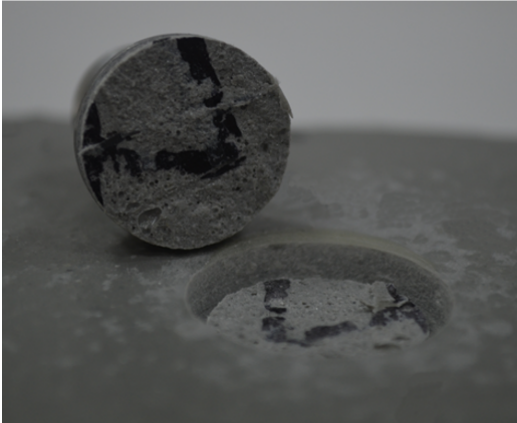
Close up detail of failure at mesh interface at mid depth in a traditional EPFP