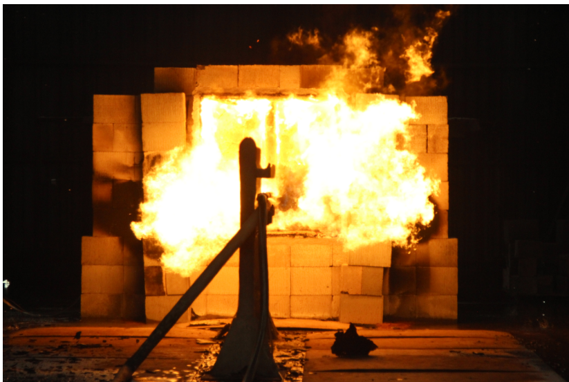
Jotachar Jet Fire test

There have been many new innovations recently within the Oil & Gas fire protection industry. It is healthy to ensure the industry remains active and driving to be at the forefront of technology and safety. One of the many innovations has been the introduction of mesh free Epoxy Intumescent Coatings. The Jotachar product range delivered the first mesh free system for all its certified fire designs & scenarios, including jet fire.